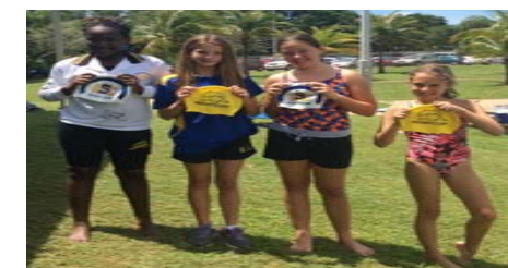
Exchanging caps with new friends